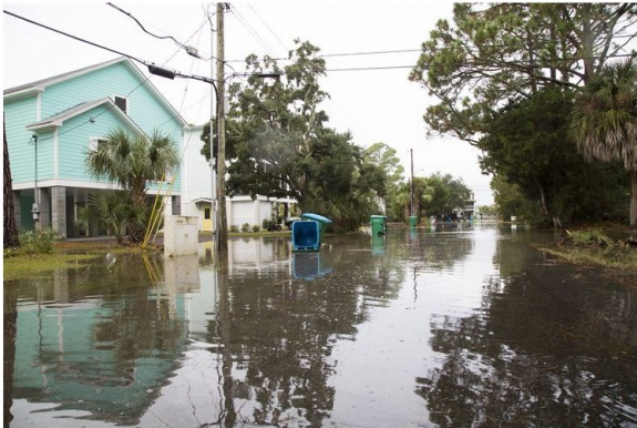
TYBEE ISLAND, A BARRIER ISLAND NEAR SAVANNAH, GEORGIA, FLOODS DURING A HIGH TIDE EVENT IN OCTOBER 2015.