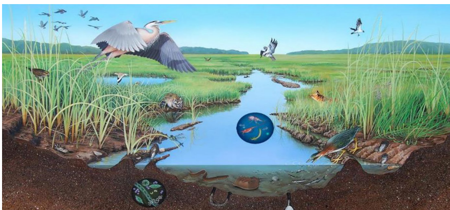
An illustration of a coastal wetland ecosystem. Credit: Barbara Harmon.