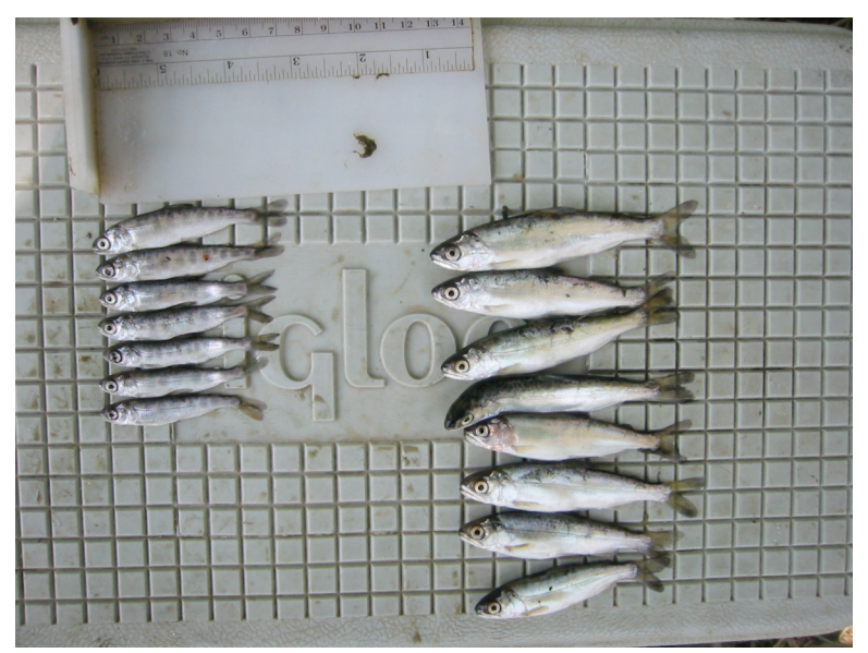
Figure 1. Juvenile Chinook on the right were reared within an enclosure within the Cosumnes River floodplain while those on the left were reared within an enclosure in the river below the floodplain (intertidal Delta habitat).

habitats, the floodplain appears to provide significantly better habitat for rearing (Figure 1).