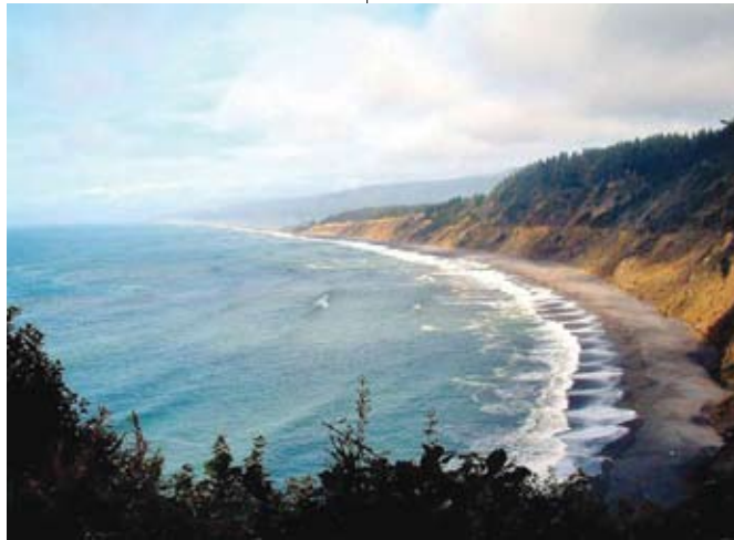
Agate Beach, Humboldt County.

In response, California Sea Grant has developed a strategic plan for 2006–2010 with five new integrated themes. The goals and objectives under each theme described in this document broadly define our research, education and outreach priorities for the next five years. These activities will be funded through traditional Sea Grant research grants, a new funding partnership with the California Ocean Protection Council, and a new grant program for “Focused Research & Outreach Initiative.”