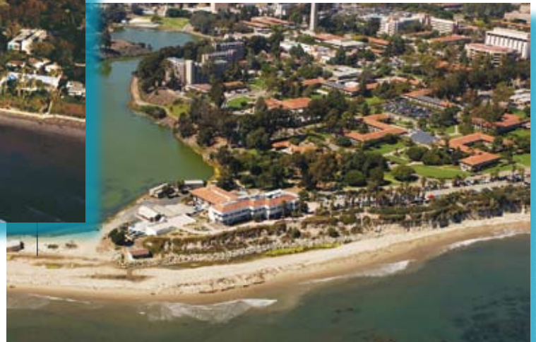
(Above) Scripps Institution of Oceanography, La Jolla. (Right) Marine Science Institute, UC Santa Barbara