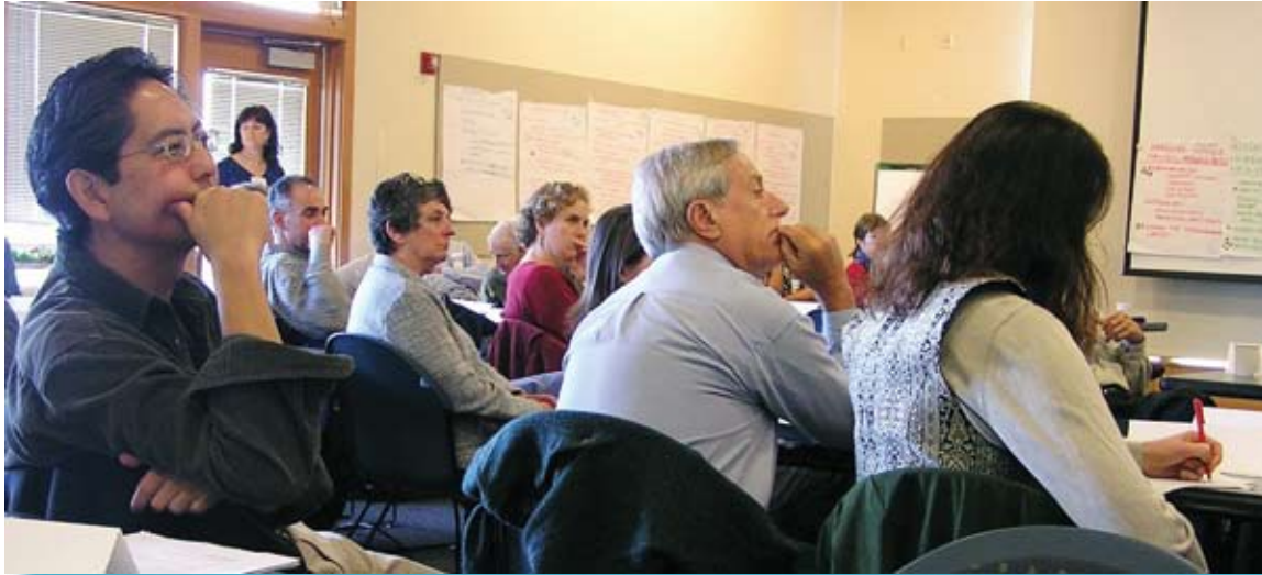
Participants at the strategic planning workshop held in Santa Cruz in November 2004.

As California Sea Grant began its strategic planning process in 2004, the state had just issued a report from the governor in response to the two national ocean commission reports. 4 The state report, Protecting Our Ocean: California's Action Strategy , called for a statewide ocean and coastal information, research, and outreach strategy, and outlined a plan to restore and maintain coastal and marine resources. The plan called for, among other things, continued investment in research to solve problems and in education to ensure environmental literacy of the general population, two areas in which Sea Grant excels.