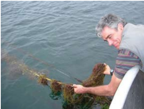
Propagating algae on rope lines for use as abalone feed.

Recent changes in fisheries management and fishery resources have created a need for more and better scientific, economic and social science information. California Sea Grant looks for opportunities to fill these information gaps to better manage these important resources and to help develop environmentally sound aquaculture practices. Sea Grant welcomes collaborations among stakeholders that: