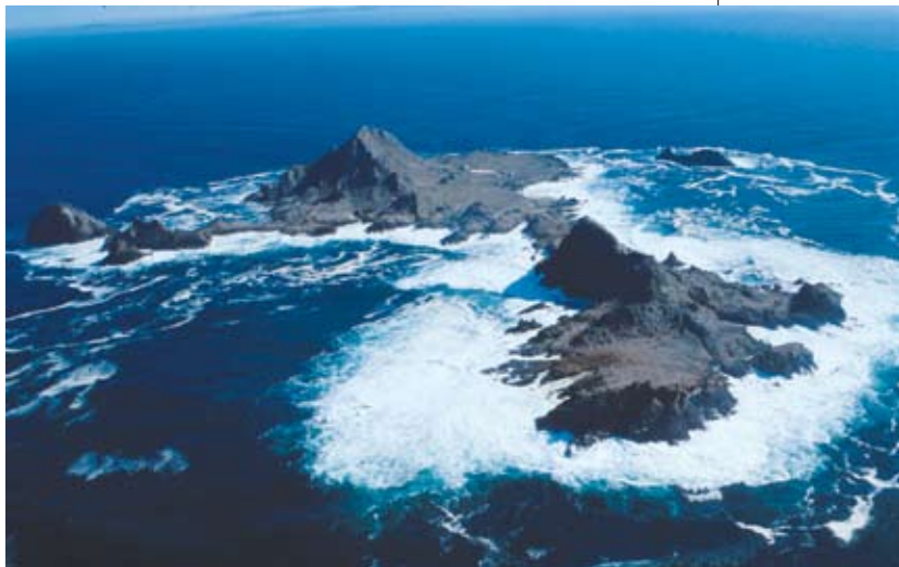
Aerial view of the South Farallone Islands, part of the Gulf of the Farallones National Marine Sanctuary.

California Sea Grant is moving in a fundamentally new strategic direction for 2006–2010.