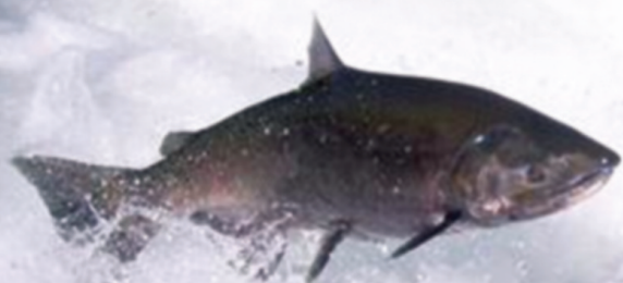
A leaping Chinook salmon.

The fraction of fish entering the delta's interior ranged from 9% to 39% during the course of the study and was found to vary