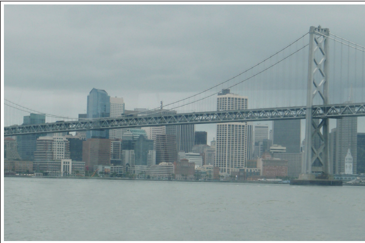
Antifouling boat coatings, contaminated sediments and some herbicides are among the continuous sources of dissolved copper in the San Francisco Bay-Delta.

The goal of this project was to use state-of-the-art analytical techniques to map dissolved copper and copper-binding ligand concentrations at sites in the San Francisco Bay, Suisun Bay, Suisun Slough, Carquinez Strait, the Sacramento River and San Joaquin River. The Delta Science Fellow also characterized the relative contributions of the Sacramento River, San Joaquin River and Suisun Slough as ligand sources.