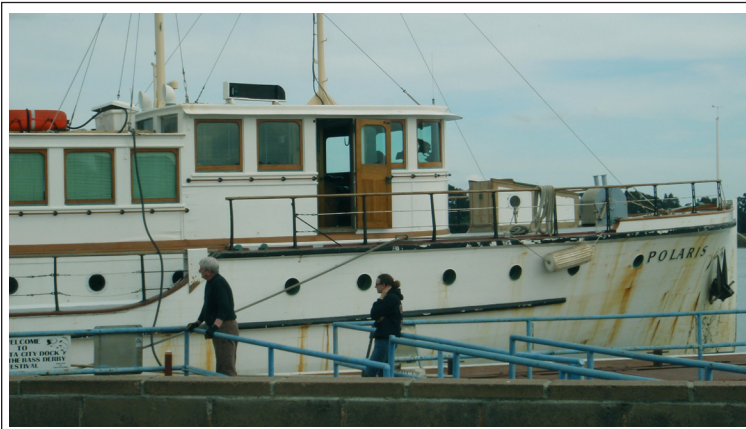
Originally a privately owned yacht, the US Geological Survey purchased the Polaris in 1966, retrofitting its upper salon into a laboratory. Each month, it completes several cruises on San Francisco Bay for water quality and sediment monitoring. Water samples for this Delta Science Fellowship project were collected during these cruises.