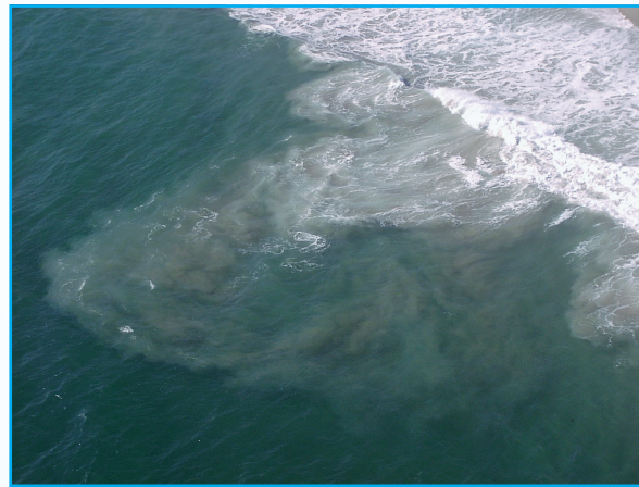
Rip currents often generate a plume of sediment moving away from shore.