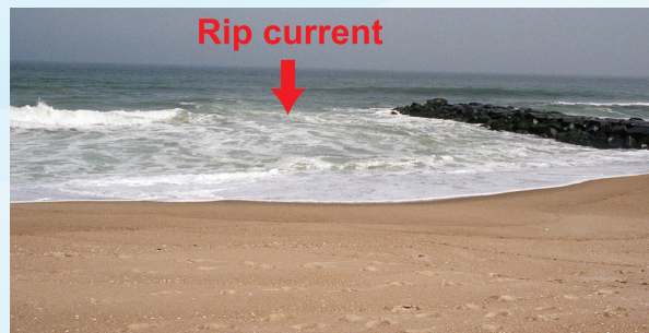
Rip currents often form near coastal structures.