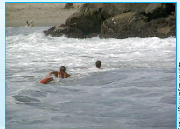
A lifeguard rescues a swimmer caught in a rip current.