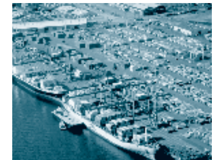
Seattle, Washington

Fearing that a mega-resort development would limit access to a popular surfing and traditional fishing area, the environmental community, as well as Hawaiian cultural practitioners, inspired the Native Hawaiian Legal Corporation to work with Sierra Club Legal Defense (now Earth Justice) to help protect natural and cultural resources in all of Hawaii. The resulting landmark 1995 Supreme Court decision in PASH and Pilago v. Hawaii County Planning Commission confirmed that all people have the right to access the shoreline for recreation, subsistence, and gathering practices. Native Hawaiians now have legal standing to contest development proposals that may impact their cultural and traditional practices. And all government agencies have a legal obligation to determine the impacts of proposed developments on cultural practices and the community.