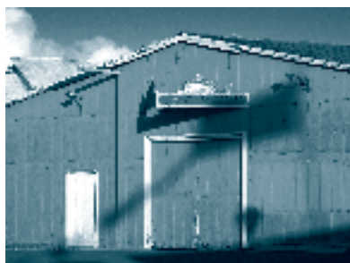
Due to soaring land values, many former fish markets, such as this one in Morehead City, North Carolina, are being replaced by new waterfront developments. Thus, the North Carolina Waterfront Access Study Committee explored options to support working waterfronts and other public access projects.