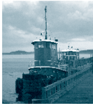
Eastport, Maine