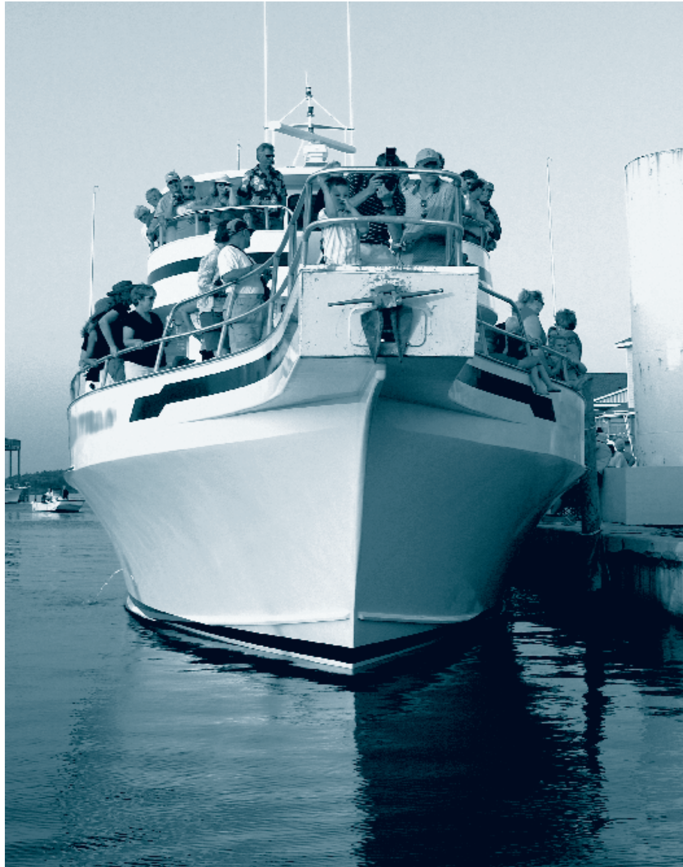
In coastal North Carolina, working waterfronts include docks for large "head boats" that offer fishing trips & other excursions.

A 1998 assessment of state CZM Section 309 programs by Rhode Island Sea Grant found that coastal states have given significant attention to access issues. The report also found that, as funding to purchase coastal property has dramatically decreased, emphasis has shifted to technical assistance and public outreach. In their report, Rhode Island Sea Grant recommended that the types of tools and programs used to acquire public access be documented, and that a stronger effort by NOAA to communicate specific public access success of state Coastal Zone Management programs was needed. Hopefully, the solutions described in this section will fulfill, in part, Rhode Island's recommendation.