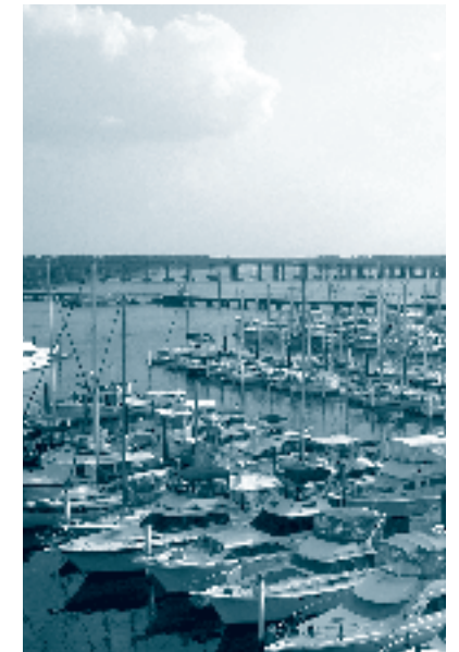
Marina in New Bern, North Carolina

The goal of this report is to highlight the national extent of coastal access conflicts and present solutions, rather than specifically analyze the environmental impacts of coastal access. However, many survey respondents see environmental effects as integral to the conversation about access. In their view, it could be said that we are loving our coast to death, as wildlife and their habitats will experience the ramifications of taking no action to address coastal access conflicts in the United States.