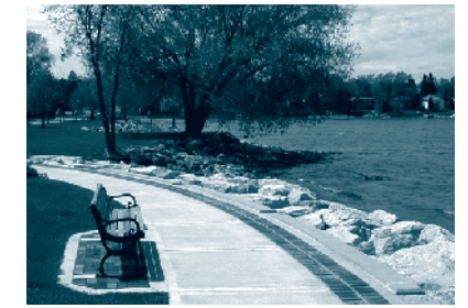
Scenic water vistas, tree-lined streets, inviting bike paths, parks and green spaces encourage all ages to experience the many year round activities that draw people to Sturgeon Bay, Wisconsin. The waterfront experience is enhanced by public access, shoreline walkways, marinas, informational plaques, observation points, and self-guided tours.

SMART GROWTH approaches provide one possible tool for communities seeking to balance economic benefit with environmental protection. In cities and older suburbs, smart growth approaches invest time, attention, and resources in restoring community and vitality. New development is generally more town-centered, transit- and pedestrian-oriented, and has a greater mix of homes, offices, shops, and other uses. Open space is preserved or enhanced. Smart growth principles were developed in 1996 by the Smart Growth Network, which is a group of private, public, and non-governmental organizations working together to improve the quality of development in neighborhoods, communities, and regions across the United States. These principles help guide growth and development in communities that have a vision of what they want their future to be and of what they value in their community; however, the principles do not directly address coastal and waterfront communities. Coastal smart growth elements were drafted by a collaborative team from EPA, NOAA, and the U.S. Department of Agriculture.