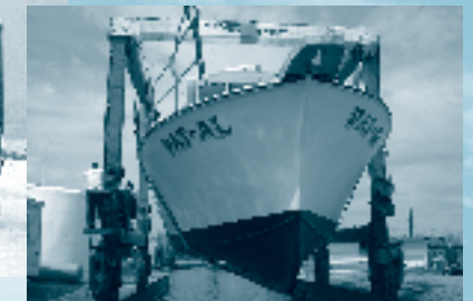
Boat going into water.

Because storm surges destroyed launching equipment, even seaworthy boats could not be placed in the water. The Port and Town of Valdez, Alaska, donated a surplus 60-ton Marine Travelift to Plaquemines Parish, Louisiana. Louisiana Sea Grant worked in conjunction with the Washington and Alaska Sea Grant programs, the Pacific Coast Congress of Harbormasters, and the Port of Valdez, Alaska, and others to transport the equipment from Alaska to Louisiana, where it is now helping the fishing industry get back to work.