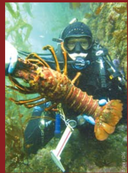
Scuba diver displays a California spiny lobster. When attempting to capture lobster, avoid grasping the legs or antennae as lobster that escape with broken appendages produce fewer offspring while recuperating.

Common spiny lobster predators include giant sea bass, California sheephead, cabezon, horn shark, leopard shark, octopus, sea otters, and man.