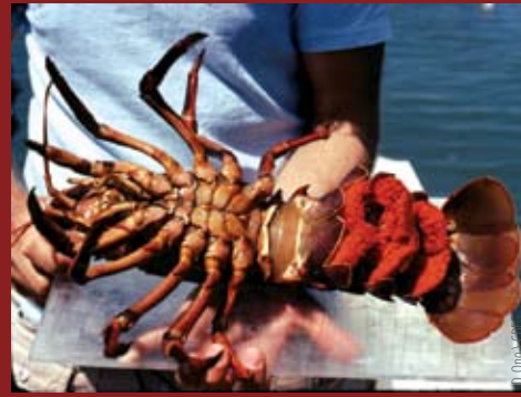
A "berried" female lobster with thousands of bright orange eggs attached to the swimmerets on the underside of her tail.

Spiny lobster usually move into shallow water during spring and summer, and migrate to deeper water in fall and winter. Adult lobster have been found as deep as 240 feet during the winter, possibly to avoid the effects of stormy weather.