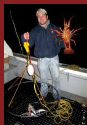
Traditional hoop net with two large metal rings joined by collapsible mesh netting.

One of the easiest and quickest methods for cooking lobster is boiling, which takes only 10 to 15 minutes depending on the size and number of lobster being cooked. Lobster turn bright red when boiled. Broiling and barbecuing are also good cooking choices.