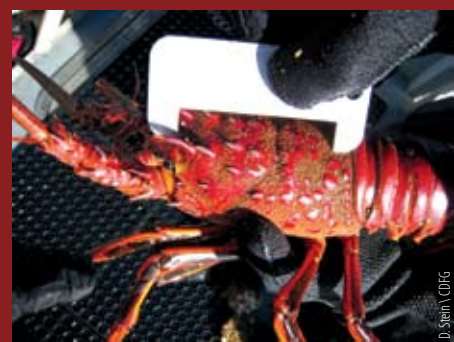
A legal-sized lobster carapace is as large or larger than the fixed gap of the measuring gauge.

🦞 Both lobster divers and hoop netters must carry a lobster gauge when attempting to take lobster. The gauge is a metal or plastic measuring device that has a fixed gap of 3/4 inches for determining the legal size of the lobster. Lobster gauges can be purchased at most dive and tackle shops. Divers may bring lobster to the surface of the water for the purpose of measuring, but no undersized lobster may be retained by the diver, brought aboard any boat, or placed in any type of receiver. Hoop netters are required to measure lobster immediately upon